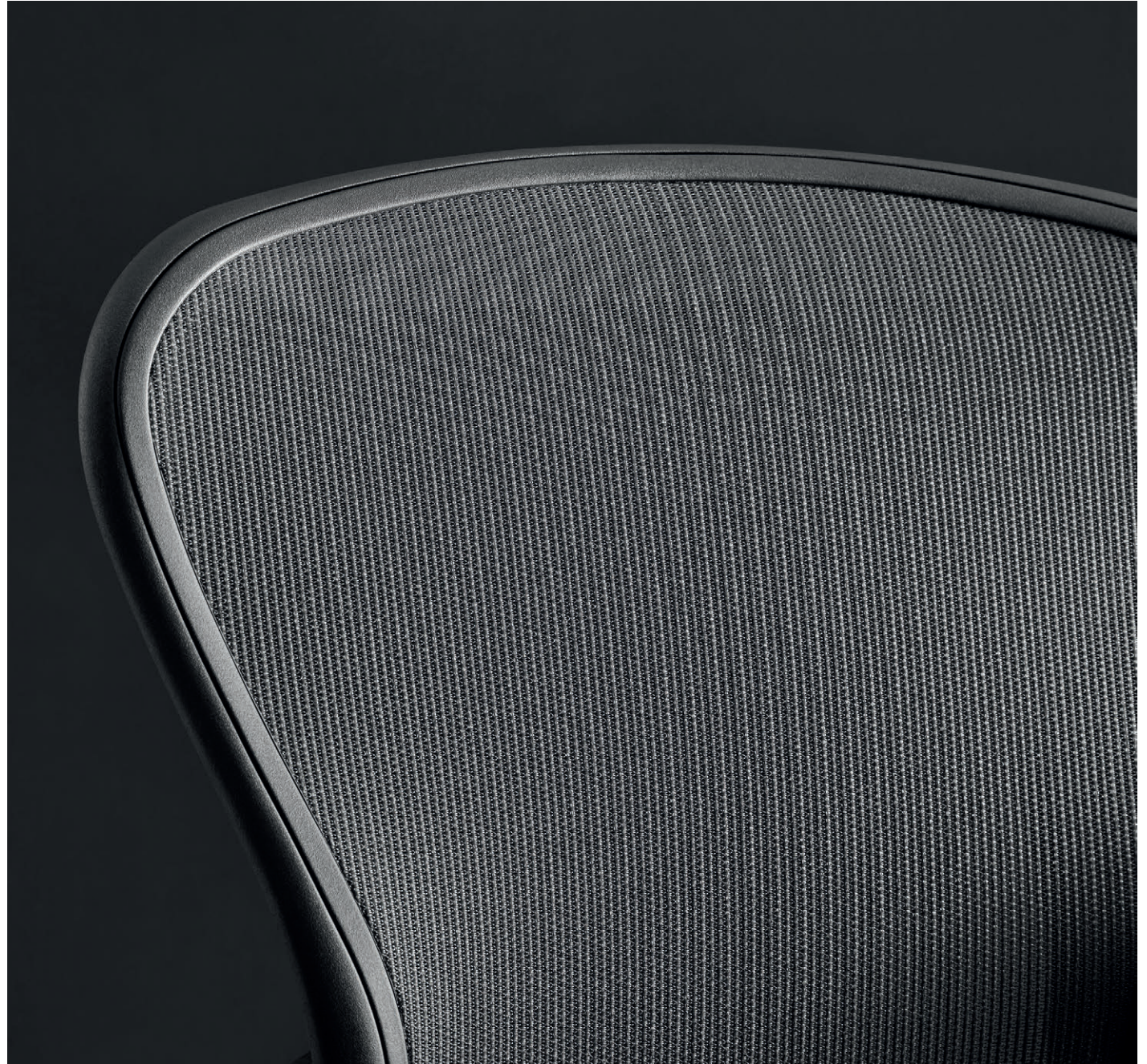
Aeron's new 8Z Pellicle offers unprecedented comfort through eight varied zones of tension in the seat and back.

With PostureFit SL, adjustable, individual pads stabilise the sacrum and support the lumbar region of the spine to mimic a healthful standing position.